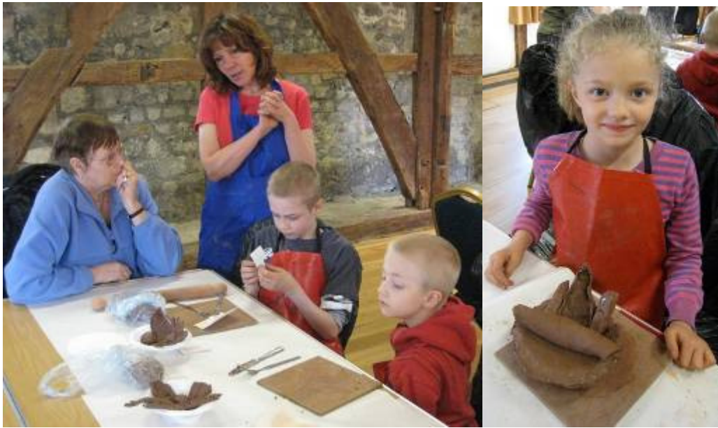
Southampton children at a Tudor food workshop during the Easter holidays