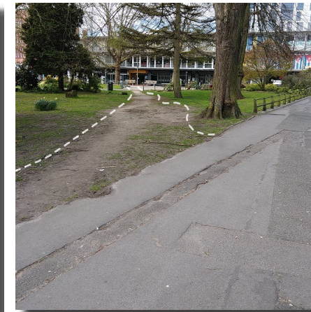
from New Road