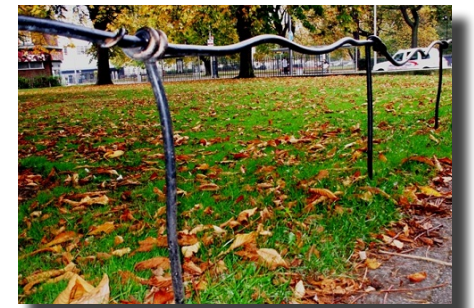
Organic Knee Rail