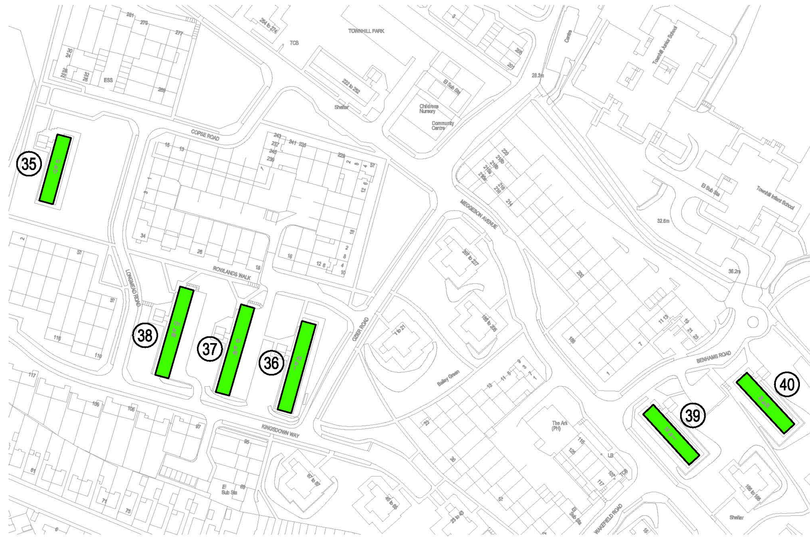
AREA: TOWNHILL PARK