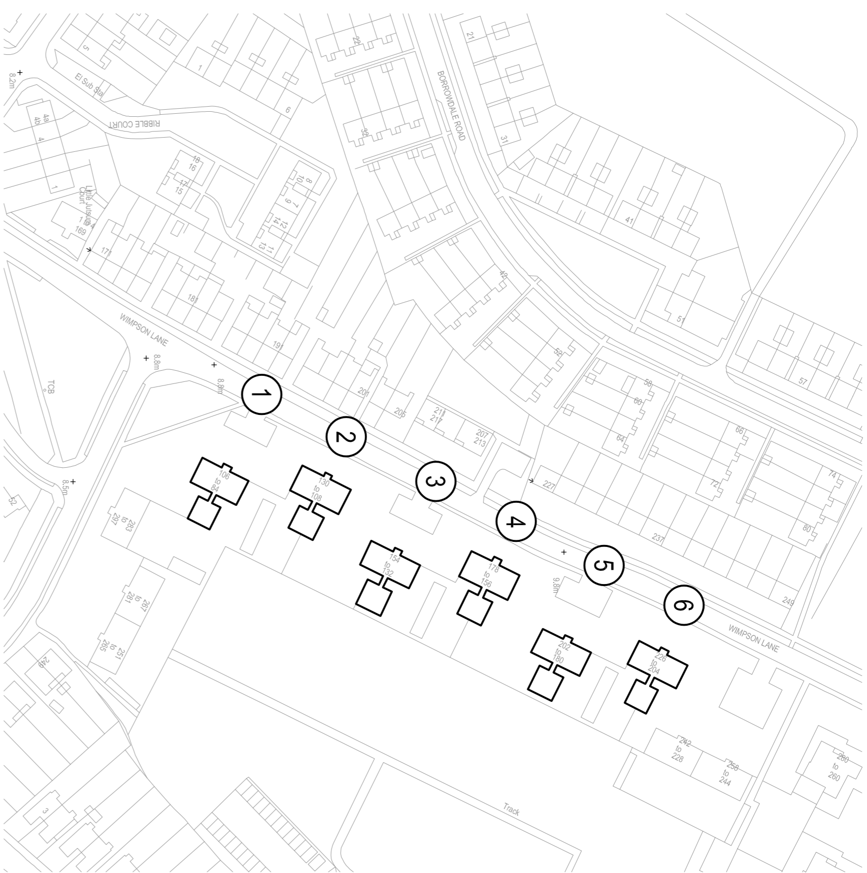
AREA: WIMPSON LANE, MILLBROOK