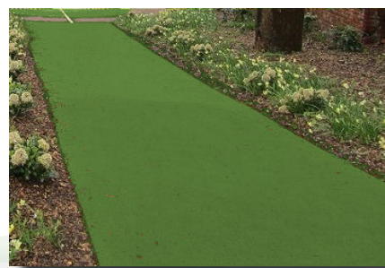
Green Rubber Crumb Path