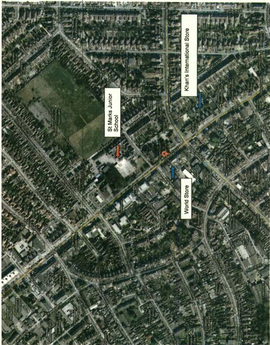
Map of Shirley Road, Southampton