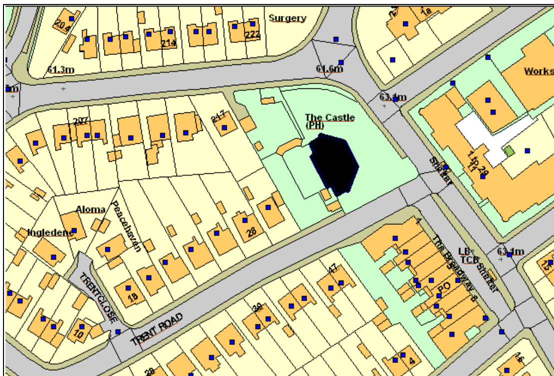
This map is reproduced from Ordnance Survey material with the permission of Ordnance Survey on behalf of the Controller of Her Majesty's Stationery Office © Crown copyright. Unauthorised reproduction infringes Crown copyright and may lead to prosecution or civil proceedings. Southampton City Council Licence No. 100019679 2007.

Application Valid Date: 22nd February 2013