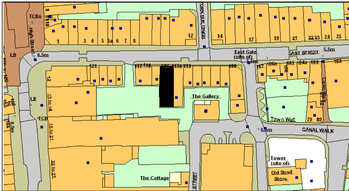
Unauthorised reproduction infringes Crown Copyright and may lead to prosecution or civil proceedings. Eastleigh Borough Council Ordnance Survey Licence Number 100019622 (2007).