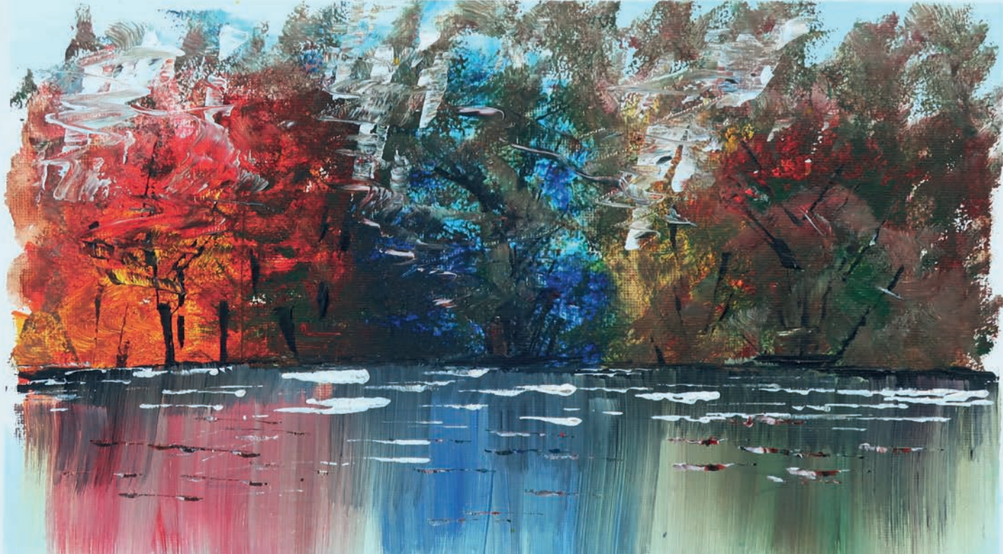
Painting from the Change Grow Live Recovery Artwork Exhibition 2022.