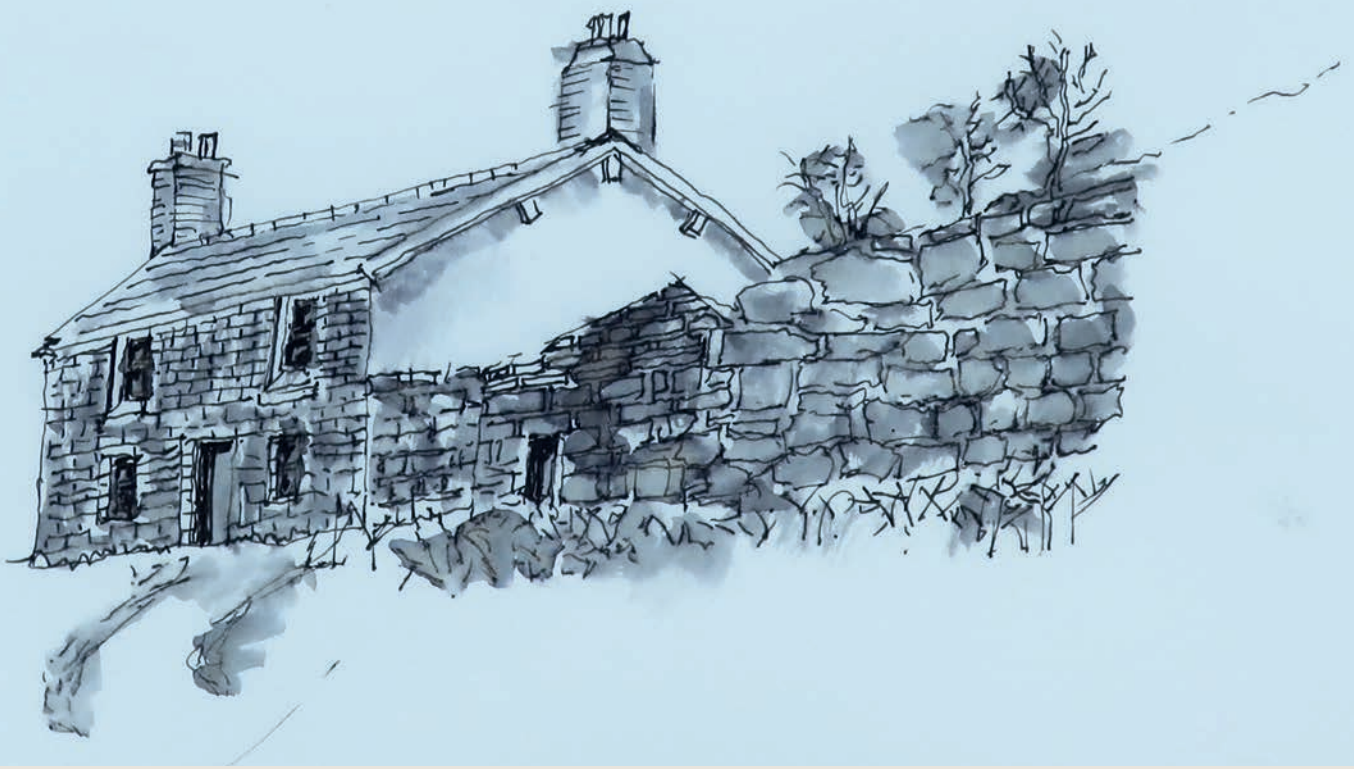
Sketch from the Change Grow Live Recovery Artwork Exhibition 2022.