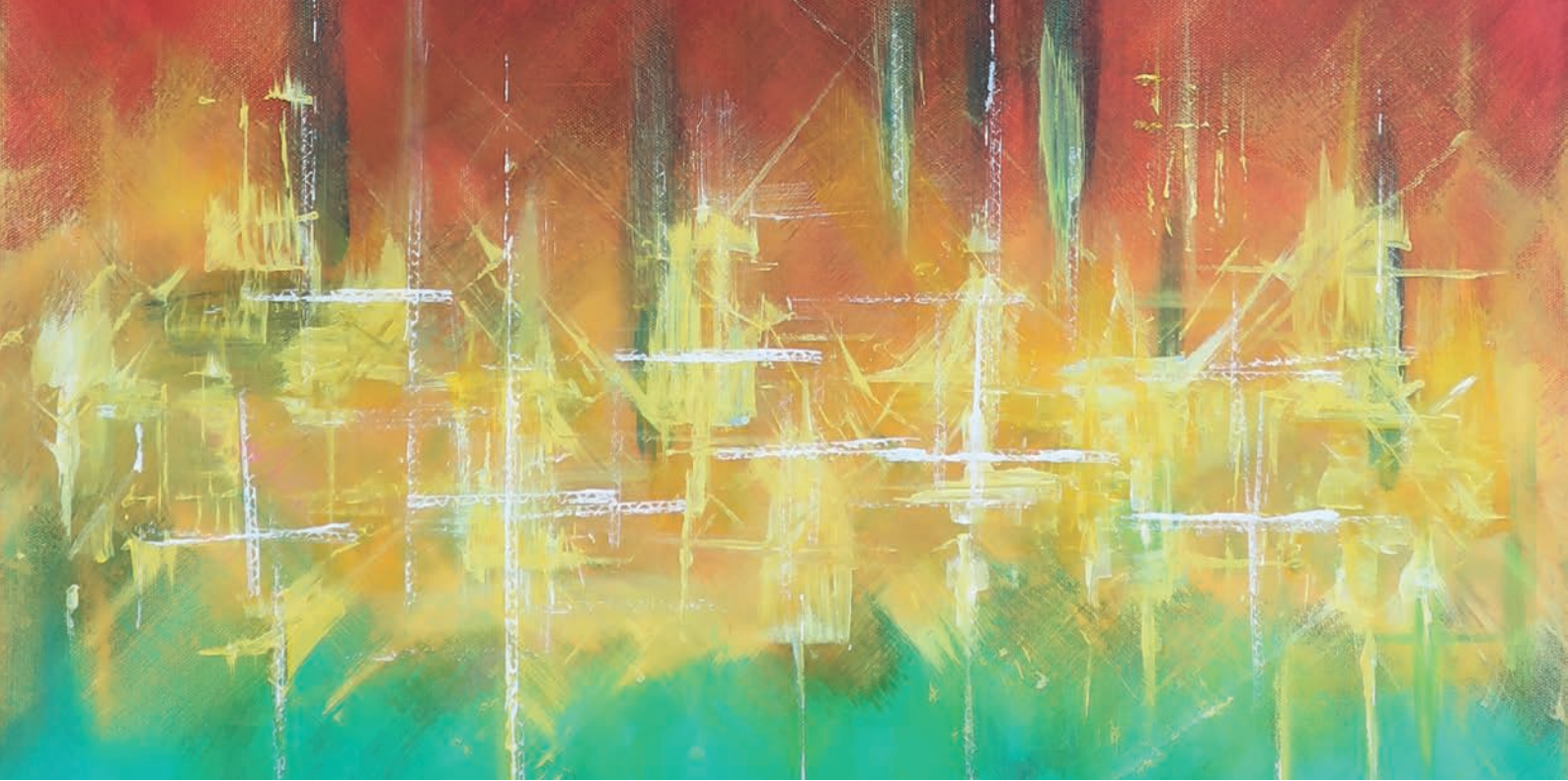
Painting from the Change Grow Live Recovery Artwork Exhibition 2022.

This strategy does not reflect everything that is happening in the city related to tobacco, alcohol and drug-related harm. The Safe City Partnership, for example, leads on community safety including reducing violent crime related to Tobacco, Alcohol and Drugs. The new Reducing Drug Harm Partnership, set up to oversee the implementation of the 2021 National Drug Strategy, brings together key leaders including Police, Probation, Public Health, Primary Care, University Hospital Southampton, Mental Health Services and Southampton City Council. The Children and Young People's Strategy and the Southampton City Council Corporate Plan 2022 - 2030 both focus on ensuring all children have the best start in life. Safeguarding Boards review and protect the needs of children, young people and adults from serious neglect or abuse. The new Domestic Abuse and Violence Against Women and Girls Strategy highlights how alcohol and drugs affect domestic abuse. Schools teach children and young people knowledge and skills to help them resist any pressure to experiment with substances. This work - and much more - complements the work of the Health and Wellbeing Board and this strategy.