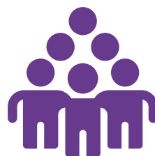
Caring for more than one person