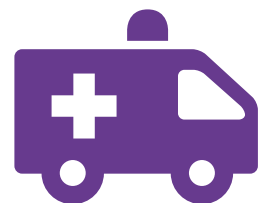
Dealing with emergencies