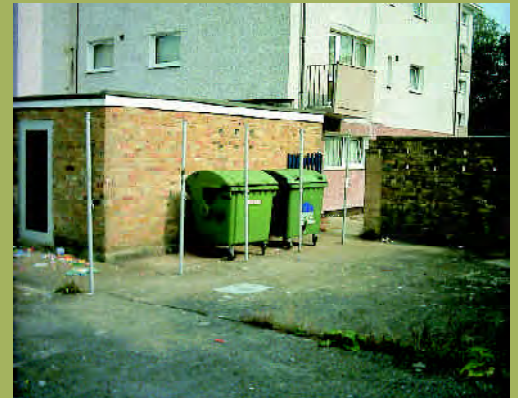
Waste storage areas should be provided to prevent eye-sores such as this

9.3.5 Responsibility for the transfer of bins to and from the collection point should be determined from the initial stages of planning the development.