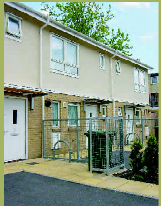
This galvanised metal fencing is attractive but is not designed to conceal the wheelie bin