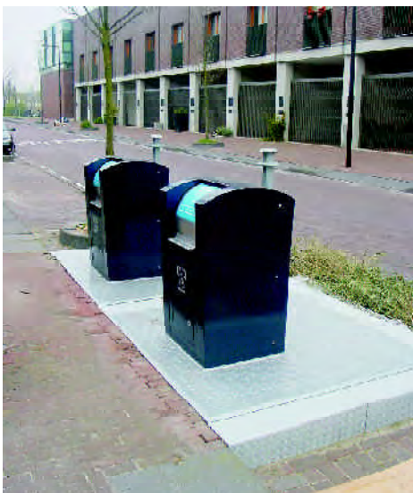
These underground waste storage systems in Amsterdam are an innovative way of containing waste discretely, however any proposals to use similar facilities should be discussed with the Waste and Recycling Manager