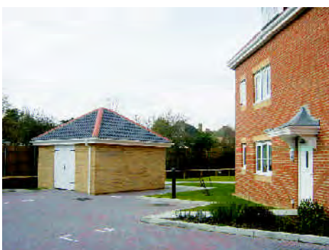
A free standing building provided for waste storage has been planned as part of the landscape and parking layout. However the side walls of the building could have been softened by evergreen shrubs - Fareham

9.4 The detail design of bin storage facilities should be submitted as part of the planning application. A waste management plan may be required as part of a Section 106 agreement. Innovative solutions are sought that are integral to the design of the development, its landscape setting and that make a positive contribution to enhancing the character of the area.