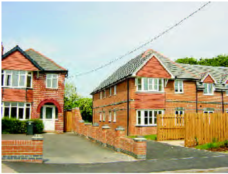
Waste storage appears to have been an afterthought for both of these developments (above and below)