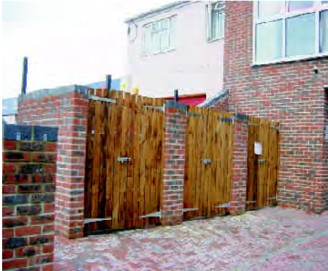
Full height storage areas are suitable for bins serving several residents

9.2.2 Residents must have access to an outside storage area for movable (individual or communal) waste, mixed dry recycling, and recycling containers, meeting the requirements of the waste collection authority specified in the following table: