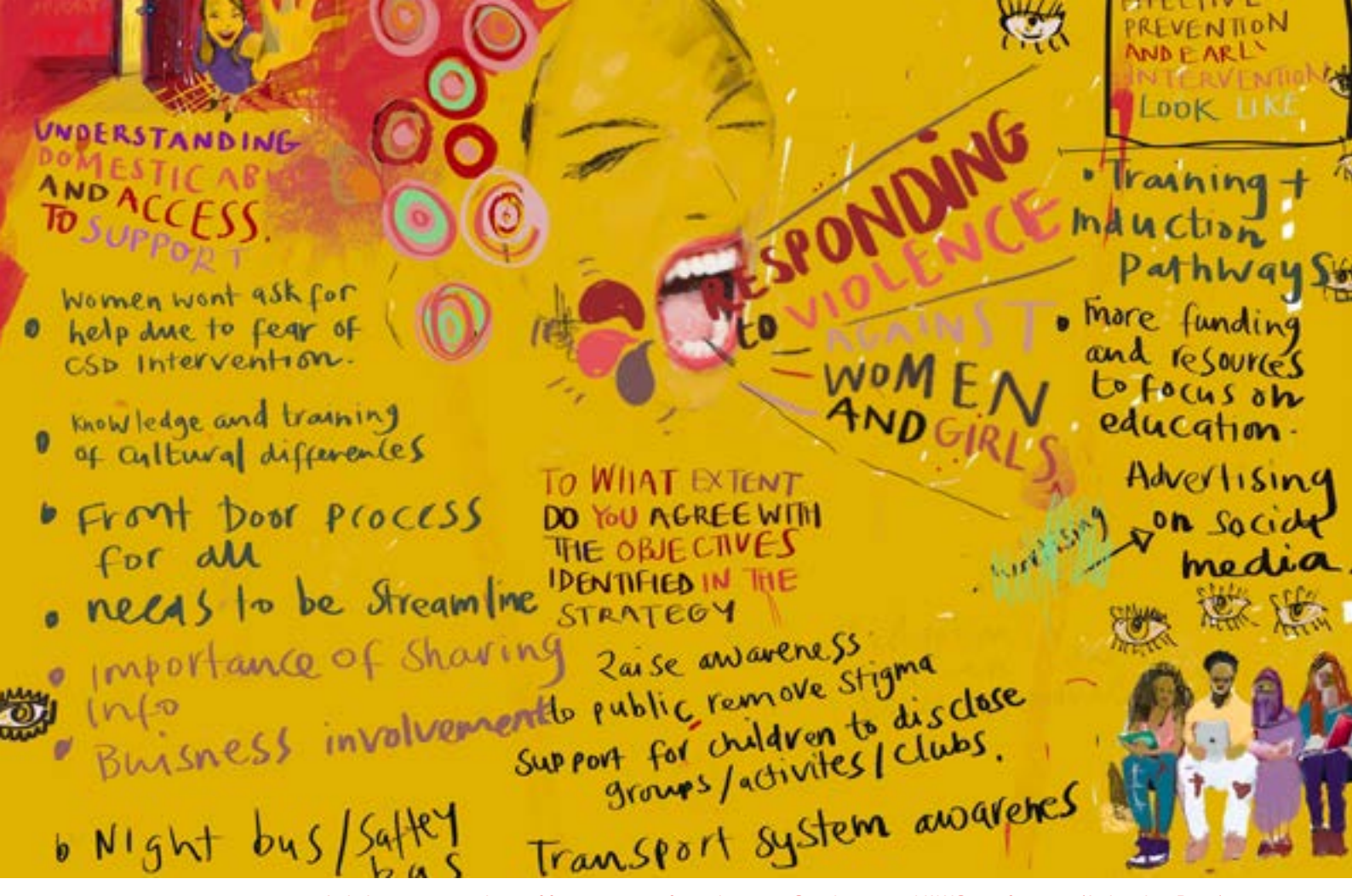
Artistic representations of focus groups from the 2021 Southampton VAWG conference (Artist: Joe Ross)

More data and information, including the annual Safe City Assessment are available from Southampton Data Observatory.