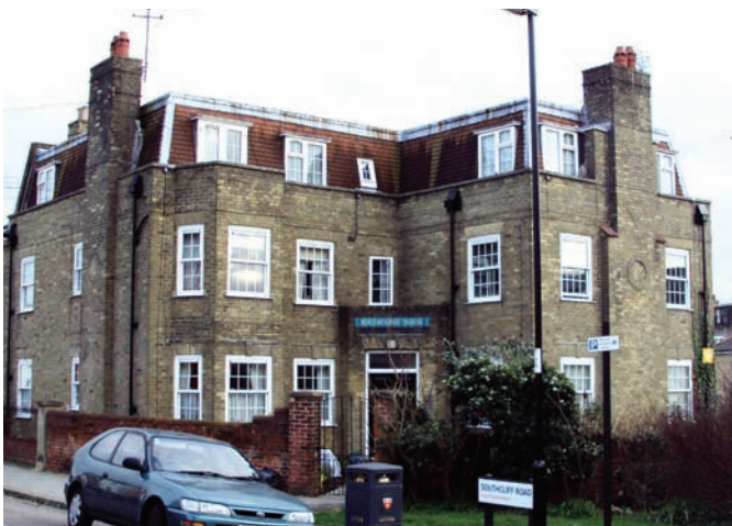
Fig. 27 Southcliff House