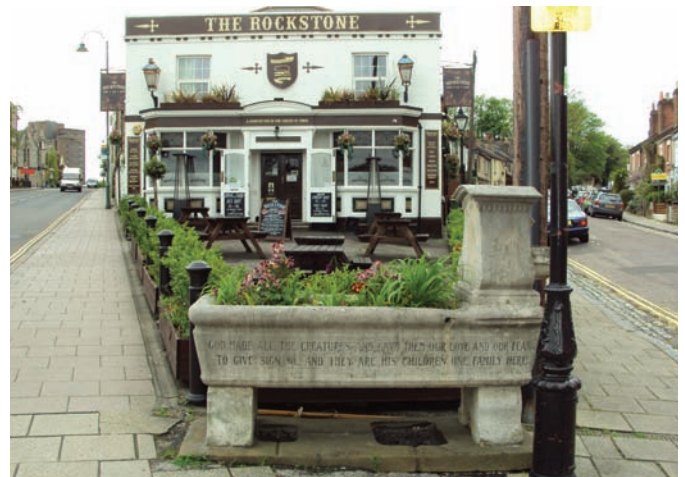
Fig. 24 Public House and drinking fountain

With regards to the cottages, early 19th century illustrations (by TG Hart) show a small group of cottages there. 1802 maps show no other buildings in Rockstone Lane, whereas the 1842 map shows two detached buildings on the north side, with no buildings on the south side. The 1843 Lewis map shows terrace of houses towards the east end of south side of lane, and the public house, with two detached buildings shown on north side.