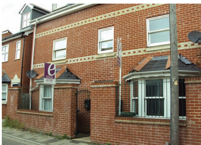
Fig. 19 31 – 33 Onslow Road Fig. 20 Warehouse building in Lyon Street.