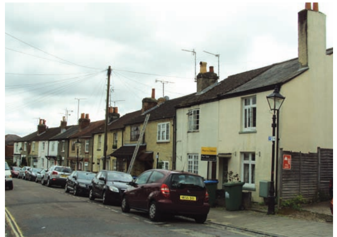
Fig. 26 Cottages on south side of Rockstone Lane