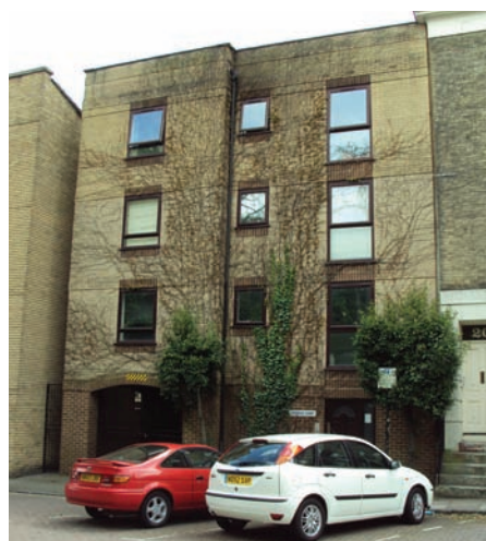
Fig. 11 Nos. 1 to 8 Cranbury Place Fig. 12 Nos. 9 -15 Cranbury Place