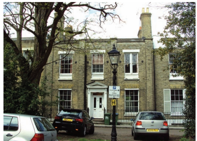
Fig. 10 No 6 Cranbury Terrace