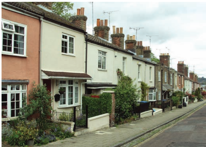
Fig. 23 General view of Rockstone Lane

Rockstone Lane was an important part of Southampton’s road network in the medieval and post-medieval periods and may have been a route in pre-medieval times. It probably followed a natural stream; a bourney (small stream) is mentioned in the