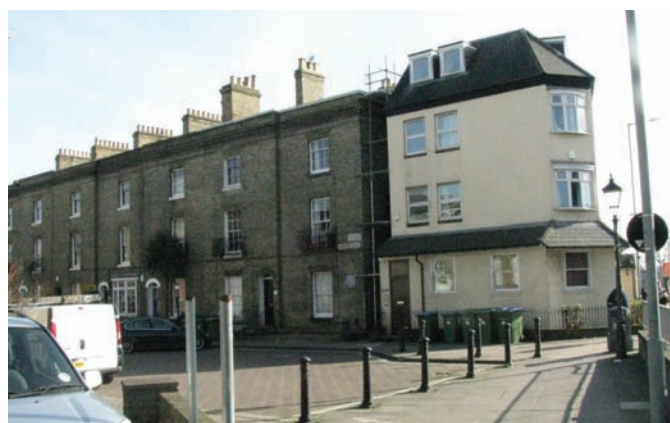
Fig. 3 General view of Cranbury Place Fig. 4 Cranbury Villa (now the YMCA Hostel) Fig. 5 Cranbury Buildings and 1-7 Cranbury Place by subway at west end of street