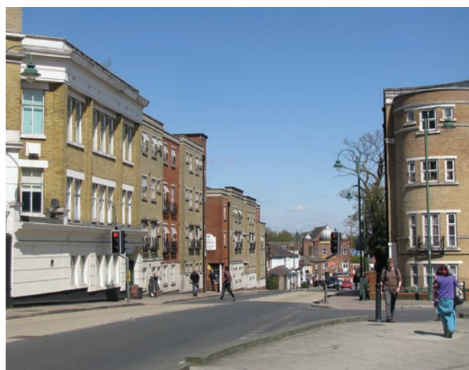
Fig. 15 Sikh Gurdwara (formerly St. Luke's Church) Fig. 16 Pollarded trees and wrought iron balconies in Cranbury Avenue.