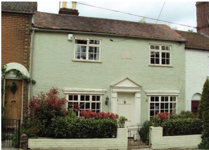
Fig. 25 Rockstone Cottage

In about 1930 at the west-end of Rockstone Lane Southcliff House, in Southcliff Road, was built by Herbert Collins to provide six flats for single women. For many years the female rent collector employed by Swaythling Housing Society Ltd lived there.