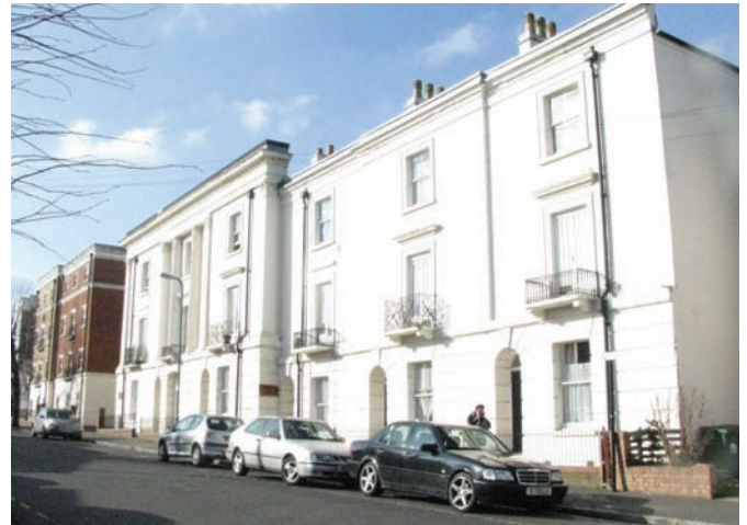
Fig. 8 Denzil Avenue

including plasterwork and cornices. Where column mouldings were beyond repair, casts were made and lime plaster replacements fitted. A scheme to create 17 new one and two bedroom flats, linked to the existing building at first floor level with car parking below, was completed at the same time.