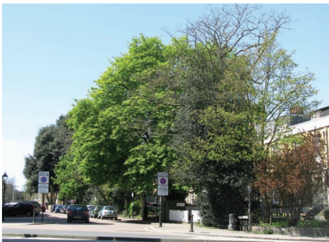
Fig. 9 Trees between Cranbury Place and Cranbury Terrace

The inherent character of Cranbury Place Conservation Area lies in its simple but dignified Georgian style terraces. Cranbury Terrace contains buildings of unified appearance