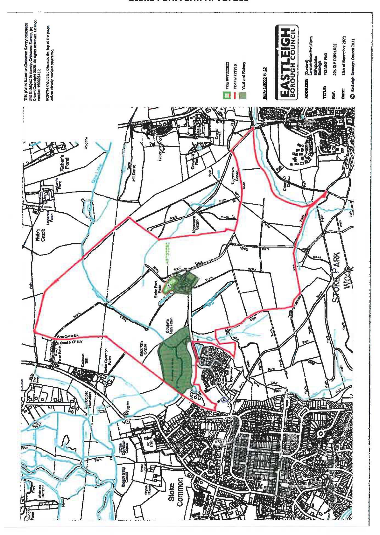
Page 2 of 4