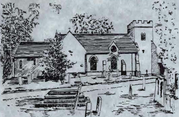
St Mary's Grade I Listed Building

The area has a number of different landowners who also manage the land. For example, the Lower Itchen Valley Nature Reserve is owned and managed by Eastleigh Borough Council and Riverside Park is owned and managed by Southampton City Council.