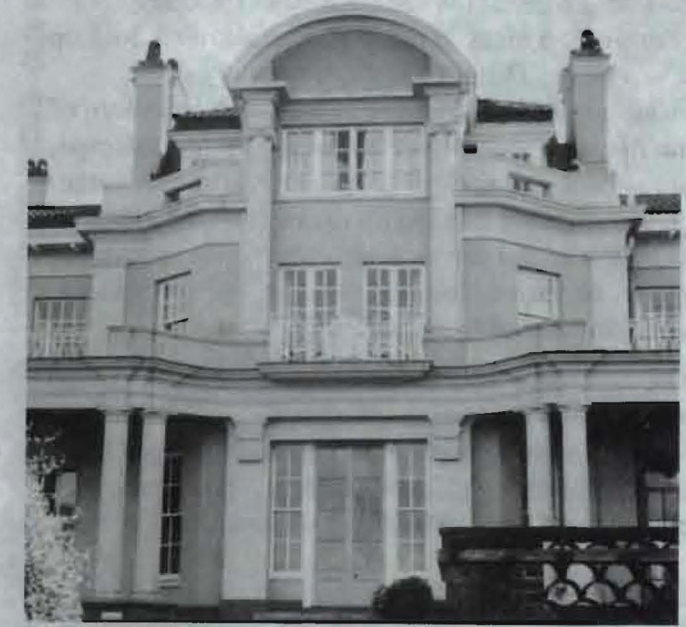
Townhill Park House Grade II Listed Building